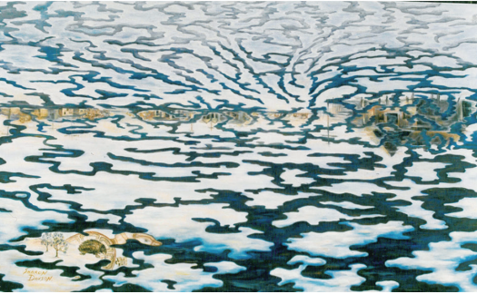
1989 "Reflections" in the collection of the Museum and Art Gallery of the Northern Territory, Darwin, Australia