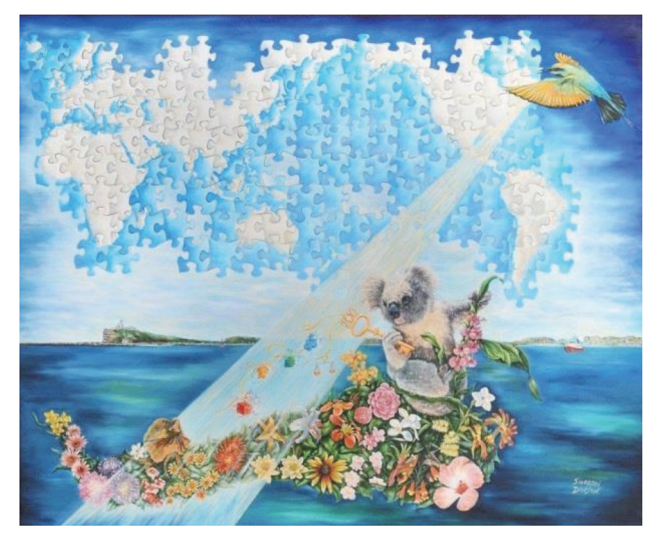
1997-99 "On the Ark of Salvation" In 2011, at $1.3 m, this painting set an Australian living artist sales record

So for three decades, working on commission has afforded her considerable freedom in the international marketplace. When her art works resell (and they do), it has mostly been directly from