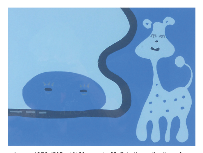
above: 1973 "What It Means to Me" in the collection of the Millicent Art Gallery, Millicent, South Australia below: 1973 "Let's Go Walking" in the collection of the Muswellbrook Arts Centre, Muswellbrook, New South Wales