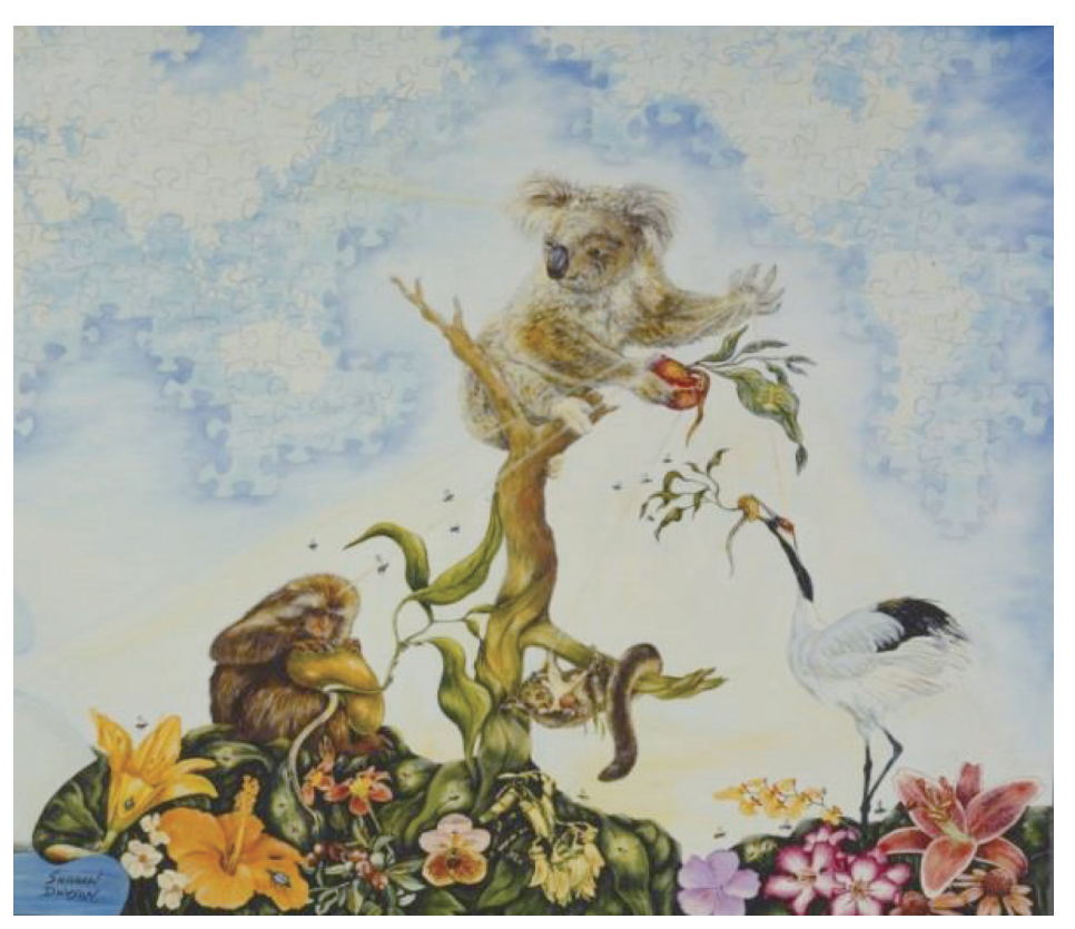
1996 "Seeds of Gratitude" in the collection of the Hikaru Memorial Museum, Takayama, Japan